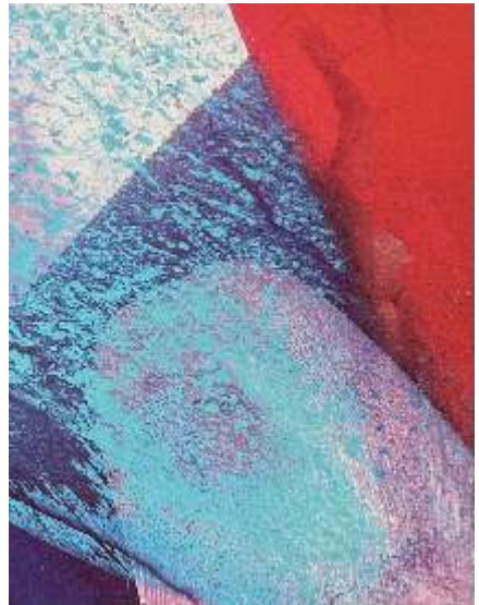
Corinna Zieleke Paintings mixed media (top) | The inne edge of the world 3 and 5 edition of 30