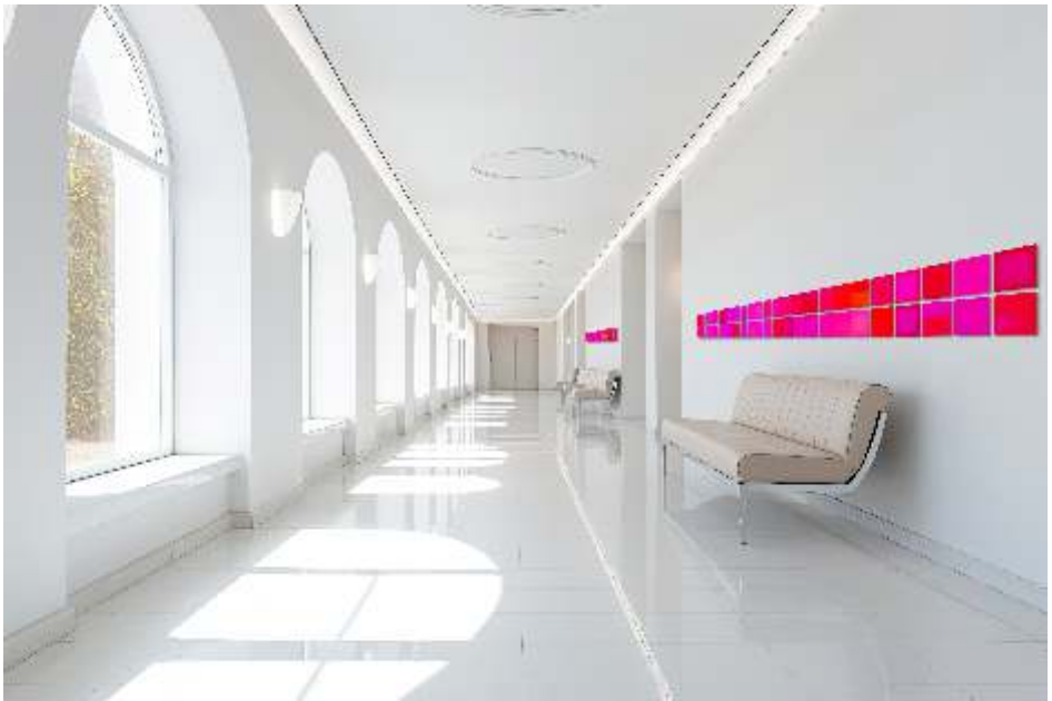
Jana Dettmer. Red Connection top left | Square 17.24 top right Installation view from Modular Mixtures